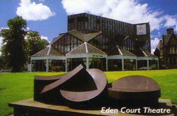
Eden Court Theatre